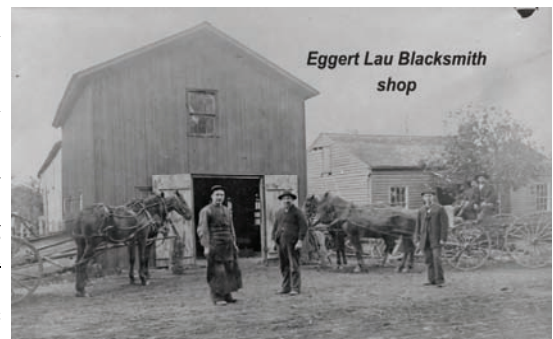
Eggert Lau Blacksmith shop