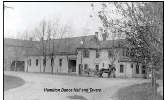
Hamilton Dance Hall and Tavern