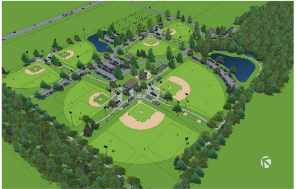
Town of Cedarburg Sports Complex

ruary with construction to begin in April of 2018.