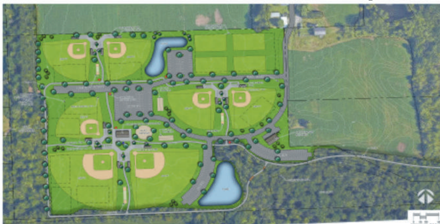
Town of Cedarburg Sports Complex Site Plan Rendering

The Finance Committee has discussed funding options for the initial stage of construction for the Cedarburg Sports Complex based on cost estimates of similar projects in the area. Fundrais-