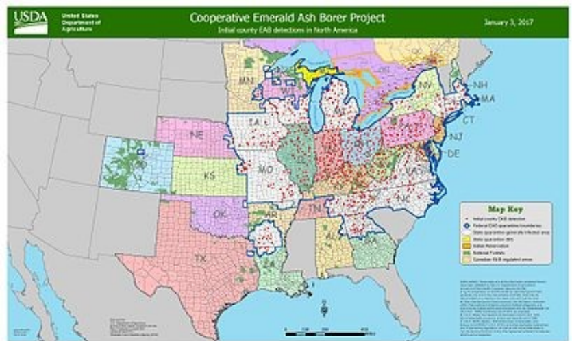
Recently planted ash trees showing thinning crowns and epicormic shoots typical of EAB infestation

This is current map of the infestation in the US and Canada