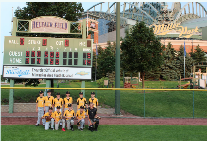
(Above: Pirates Intermediate Team from 2017 playing at Miller Park).

2018 has seen a record number of participants for open registration, setting up a great season for all levels of play. Baseball divisions include children ages 4-13 years old. Baseball teams for ages 4-10 will play in Cedarburg, with 11-13 year old teams mixing in some travel to other local Little League programs for an interleague play experience. Our softball program is for girls ages 7-12 years old, who will participate in a multi-community program including Grafton, Germantown, Menomonee Falls, and West Bend. Play for all baseball and softball teams will conclude in July. As usual, our participants will be able to take part in a variety of opportunities during the season including attending Little League Night at Miller Park, walking in the fourth of July parade, and end-of-season events.