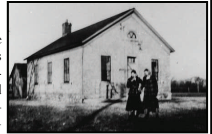
Cedar Creek School

Almost all early schools were constructed of logs, primarily due to the heavy timber growth found throughout the county. Timber, or “log”, buildings were cheaper and could be erected far more quickly than stone which would appear later as more farm fields were established and a ready supply of unwanted stone became available. As the years progressed and log structures began to deteriorate many were generally replaced with more sturdy or readily available materials. Brick schools were a rare sight before 1880. A greater number of structures were able to take advantage of the burgeoning sawmill industry which now provided framing materials and clapboard siding. These buildings were considered “balloon” architecture meaning a basic framework of studs over which the clapboard siding was nailed directly to. This type of building was difficult to heat and maintain a comfortable temperature. Another segment were the beautiful fieldstone school houses which began to be constructed about 1870. Fortunately, many of these still stand today throughout the county, preserved in all their glory. The Town of Cedarburg is very fortunate in that five former school structures are still standing for us to enjoy.