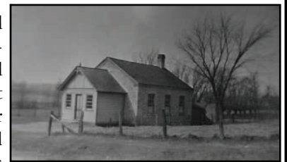
Sunny Brook School

The majority of early schools were what we would consider today to be ‘public’. As early congregations began to establish schools of their own, many, if not most, conducted instructions in German. A typical school day started with German reading and religion being taught until first recess in the morning, followed by arithmetic which would end at noon. Afternoons were devoted to studies taught in the English language.