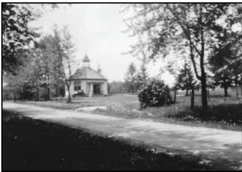
Pleasant Valley School